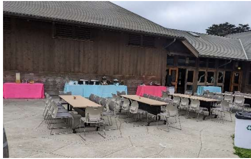
Education Center Patio Max 150 guests w/ side patio