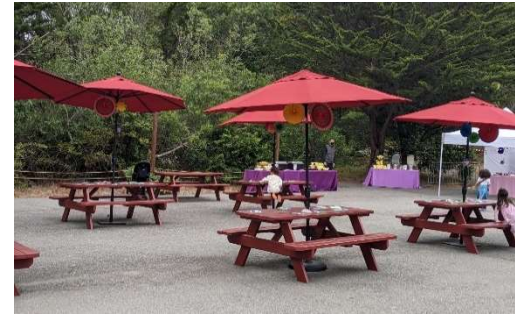
PICNIC PAVILION Max 100 seated plus 50 standing