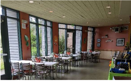
LEMUR ROOM Max 40 guests